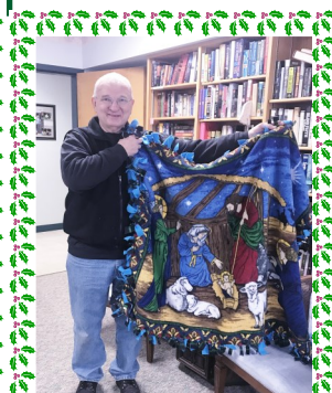
FLEECE NATIVITY THROW- JIM WELCH